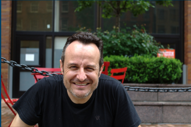
Valencia (Spain), June 6, 1975